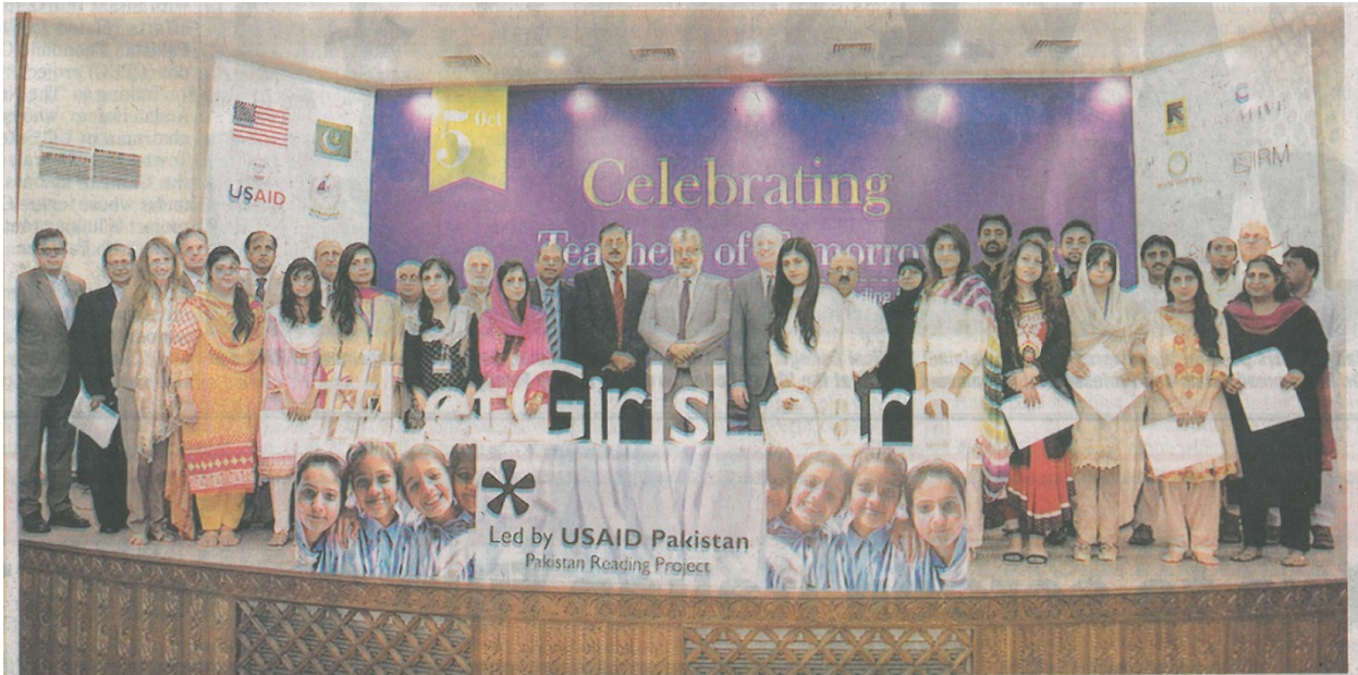
ISLAMABAD: USAID celebrates World Teachers Day with Pakistani teachers.